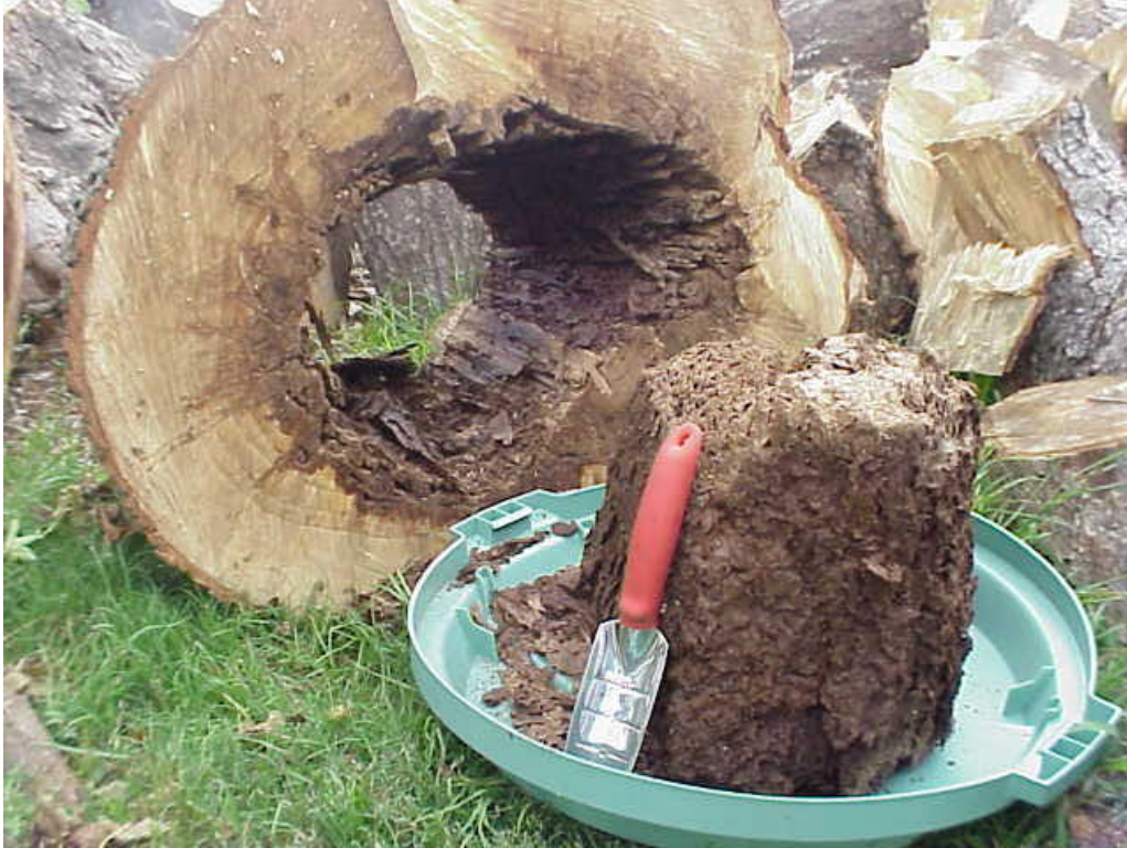
Live tree damage and colony extracted... LSU AgCenter Termite web page.

Juan Morales-Ramos is an entomologist at ARS' Southern Regional Research Center in New Orleans who is performing lab experiments to identify wood species that might deter the Formosan termite. Two types of tests are being run. In a preference study, over 30 species of wood have been offered and the amount of wood eaten by the termites is compared to blocks of Southern Yellow Pine that are used as the control. In a deterrent study, the wood samples are examined to see if they inhibit or suppress feeding or prove to be toxic. These studies indicate that the termites do not care for old growth baldcypress (actually toxic), Western and Eastern red cedar, Alaskan yellow cedar, Spanish cedar, mahogany, sassafras, and rosewood (Indian, Honduran, and Bolivian). Morales-Ramos stated that the termites would attack any commercial wood except the cedars (as tested), with juvenile wood being more resistant than the heartwood.